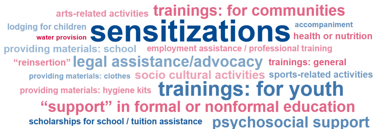
Figure 1. Word Cloud

The NGOs covered by this study target and include multiple groups and numbers of beneficiaries. The most frequently cited groups of children who participate in their activities were children living in the street, followed by children in institutions and children in domestic servitude, then displaced children and victims of child trafficking and refugees. Although several NGOs targeted and served a small number of children (one listed supporting 26 children), other NGOs served much larger numbers (an NGO whose mission focused on sports had several thousand participants within the past year).