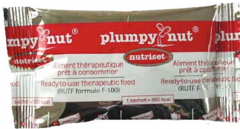
Exhibit 7 Model Plumpy'nut Sachet